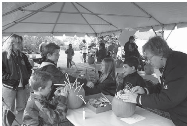
2005 Fall Family Fest – Kid's Pumpkin Decorating Contest